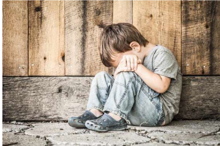
The housing crisis impacts even our youngest neighbors.

Nowhere in the US can a full-time, minimum wage employee afford a 1-bedroom apartment.